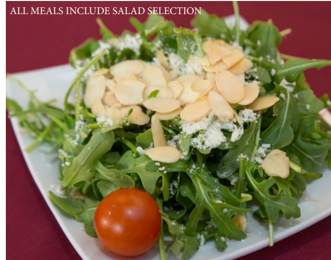
ALL MEALS INCLUDE SALAD SELECTION