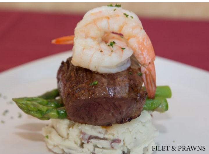
FILET & PRAWNS