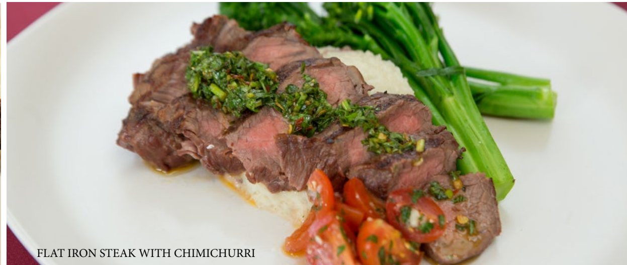
FLAT IRON STEAK WITH CHIMICHURRI

BREAKFAST | BREAKS | LUNCHEONS | DINNERS | BUFFETS | HORS D'OEUVRES | BEVERAGES 700 SOUTH ALMANSOR ST., ALHAMBRA, CA 91801 (626) 570-4600 ALMANSORCOURT.COM