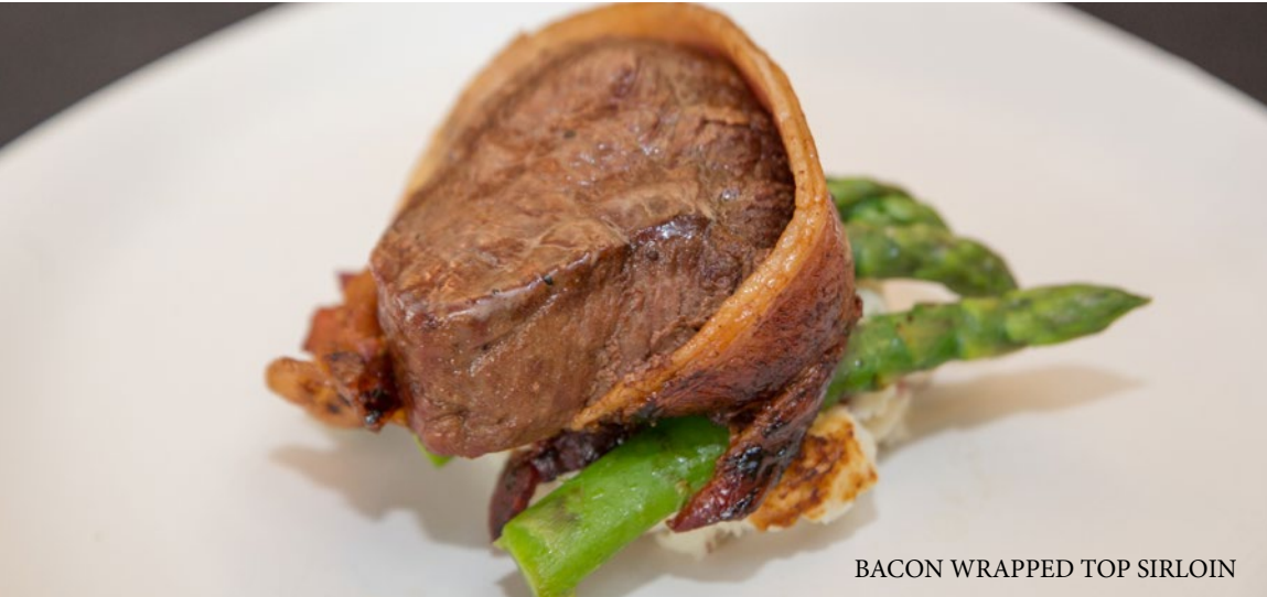
BACON WRAPPED TOP SIRLOIN