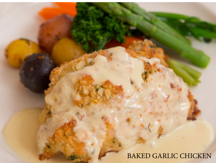
BAKED GARLIC CHICKEN

Entrées Include: Salad Selection, Chef's Selection of Accompaniments & Seasonal Vegetables, Oven Fresh Rolls & Butter, Dessert Selection, Fresh Coffee, Decaf & Tea