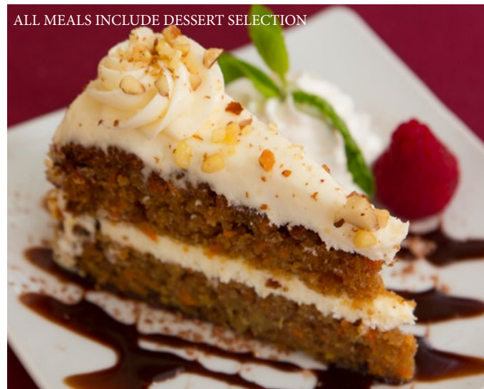
ALL MEALS INCLUDE DESSERT SELECTION

BREAKFAST | BREAKS | LUNCHEONS | DINNERS | BUFFETS | HORS D'OEUVRES | BEVERAGES 700 SOUTH ALMANSOR ST., ALHAMBRA, CA 91801 (626) 570-4600 ALMANSORCOURT.COM