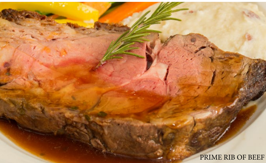
PRIME RIB OF BEEF